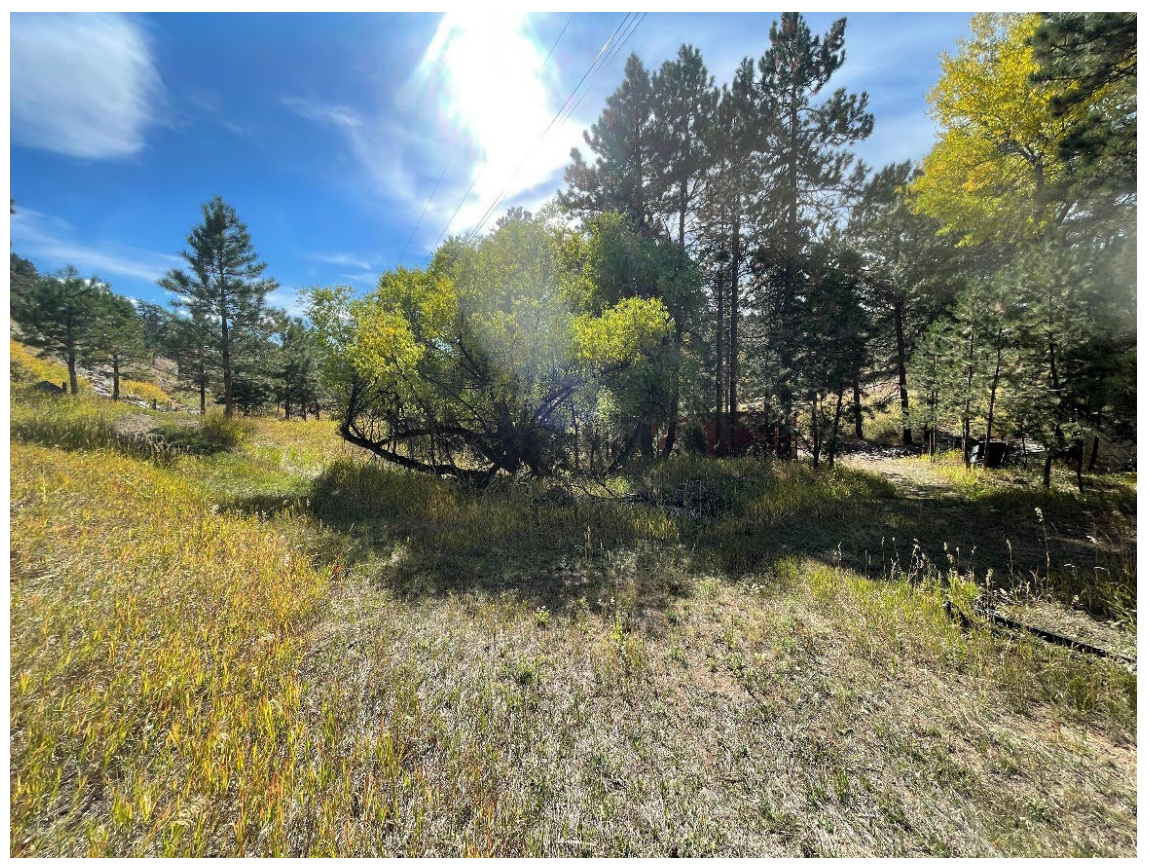
View from center of subject looking South.