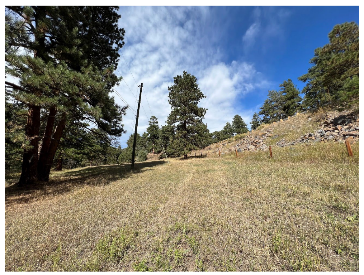
View from South of subject looking North.