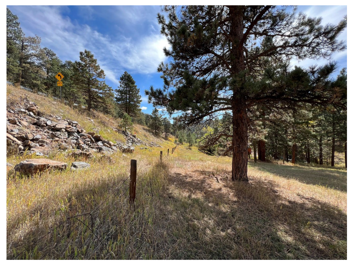
View from East of subject looking South.