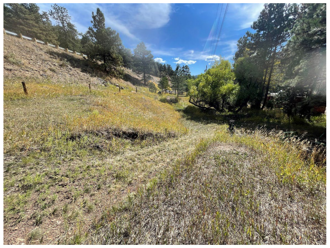
View from center of subject looking Southeast.