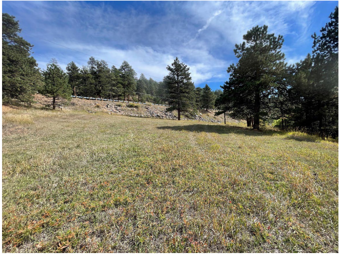
View from Northwest of the subject looking Southeast toward US 40.