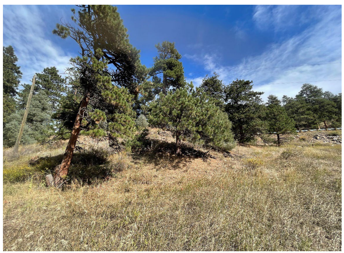
View from Northwest of the subject looking East to US 40.